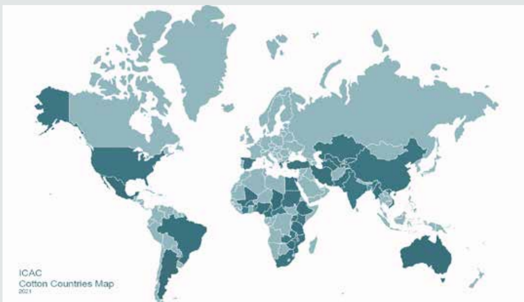
Figure 1b. COTTON GROWING COUNTRIES OF THE WORLD